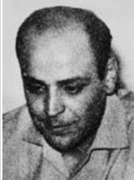
Abu Ndal circa 1982.