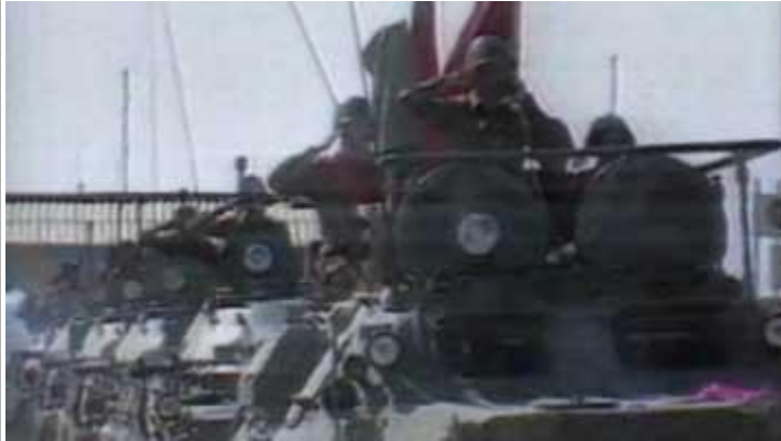
Soviet tanks entering Afghanistan in