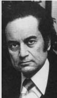
Agha Hasan Abedi.