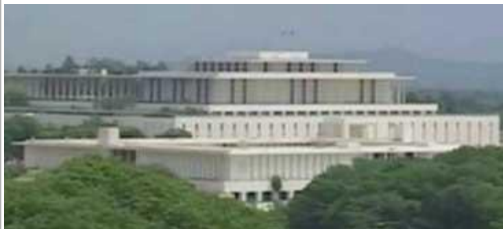
ISI headquarters in Islamabad,

Pakistan. The Pakistani ISI starts a special cell of agents who use profits from heroin production for covert actions “at the insistence of the CIA.” “This cell promotes the cultivation of opium, the extraction of heroin in Pakistani and Afghan territories under mujaheddin control. The heroin is then smuggled into the Soviet controlled areas, in an attempt to turn the Soviet troops into heroin addicts. After the withdrawal of the Soviet troops, the ISI’s heroin cell started using its network of refineries and smugglers for smuggling heroin to the Western countries and using the money as a supplement to its legitimate economy. But for these heroin dollars, Pakistan’s legitimate economy must have collapsed many years ago.” [FINANCIAL TIMES, 8/10/2001] The ISI grows so powerful on this money, that “even by the shadowy standards of spy agencies, the ISI is notorious. It is commonly branded ‘a state within the state,’ or Pakistan’s ‘invisible government.’” [TIME, 5/6/2002]