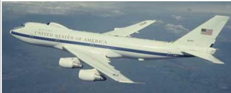
An E-4B Airborne Command