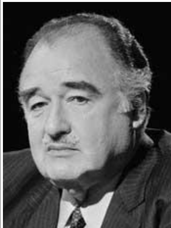
Alexandre de Marenches.