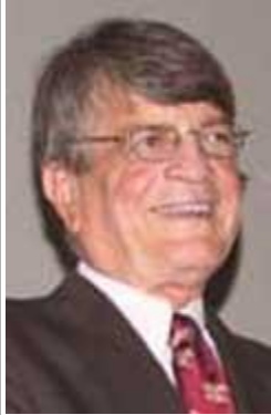
Rep. Charlie Wilson.