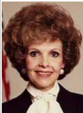
Paula Hawkins.