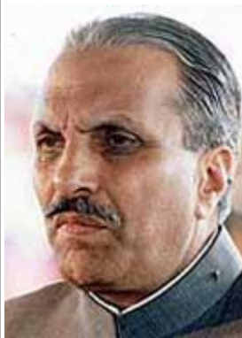
Muhammad Zia ul-Haq. General Muhammad

Zia ul-Haq seized power in Pakistan in a 1977 coup and declared himself president. The US stopped all economic and military aid to Pakistan as a result of the coup and Zia ruled cautiously in an attempt to win international approval. But immediately after the Russian invasion of Afghanistan (see December 8, 1979 ), the US allies with Zia and resumes aid. This allows Zia to use Islam to consolidate his power without worrying about the international reaction. He passes pro-Islamic legislation, introduces Islamic banking systems, and creates Islamic courts. Most importantly, he creates a new religious tax which is used to create tens of thousands of madrassas, or religious boarding schools. These schools will indoctrinate a large portion of future Islamic militants for decades to come. [GANNON, 2005, PP. 138-142] Zia also promotes military officers on the basis of religious devotion. The Koran and other religious material becomes compulsory reading material in army training courses. “Radical Islamist ideology began to permeate the military and the influence of the most extreme groups crept into the army,” journalist Kathy Gannon will write in her book I is for Infidel . [GANNON, 2005, PP. 138-142] The BBC will later comment that Zia’s self-declared “Islamization” policies created a “culture of jihad” within Pakistan that continues until present day. [BBC, 8/5/2002]