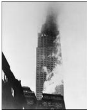
Crash by a US Army B-25 bomber on July 28, 1945. A B-25