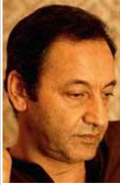
Nabih Berri in 1982.