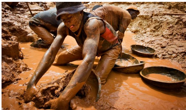
Miners near village of Kobu in northeastern Congo

Apple could easily build you iPhones and iPads, in classic timeless designs that could last for decades, that could be easily be upgraded. This would save mountains of resources not to mention the lives Congolese kids and Foxconn assembly workers. But how much profit is there in that? Apple could never justify such a humane and environmentally rational approach to its shareholders because shareholders (who are several stages removed from the “sourcing” process and don’t really care to know about it) are capitalist rationally looking to maximize returns on their portfolios, not to maximize the lifespan of the company’s products, let alone the lifespan of Congolese or Chinese. So to this end, you have to be convinced that your G4 phone is not good enough , that you “need” an iPhone5 because you need a phone that streams movies, that talks to you and more, and next year you will need an iPhone6. And even if you own an iPad3 you will soon “need” an iPad4, plus an iPad Mini, and how will you live without iTV? This incessant, exponentially growing demand for the latest model of disposable electronic gadgets is destroying societies and the environment from Congo to China and beyond.